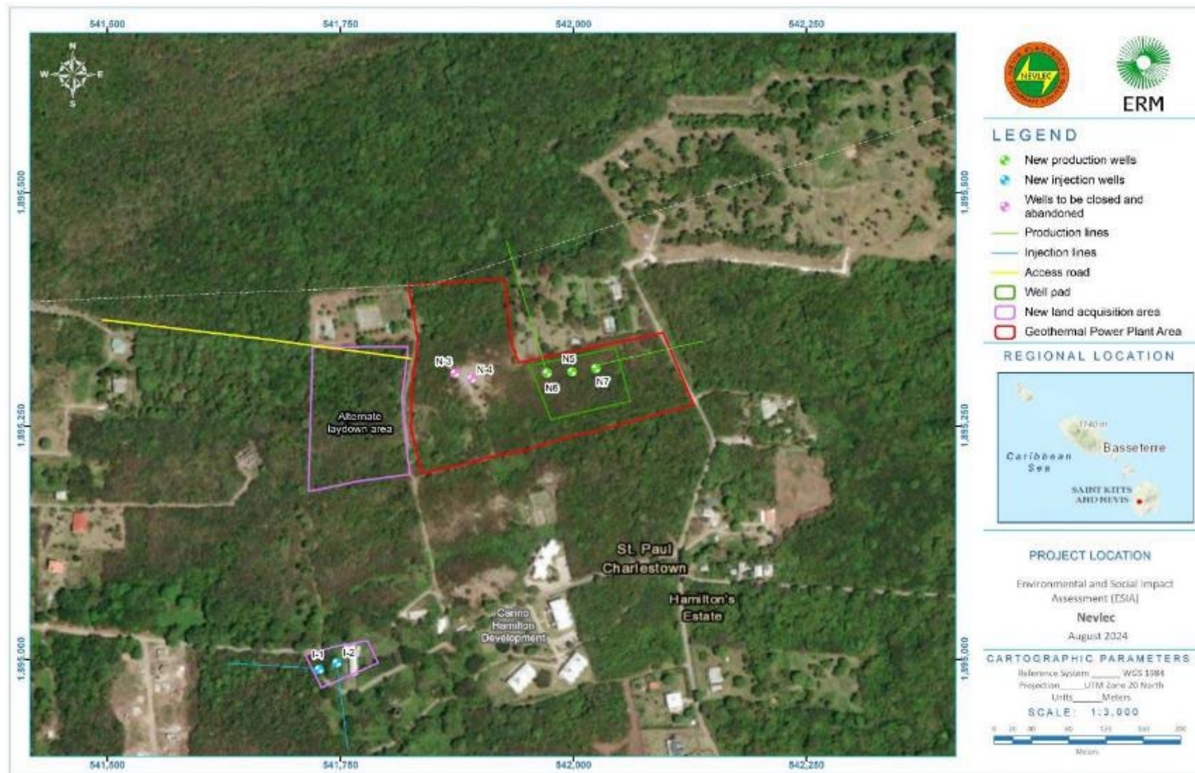
FIGURE 4.1 PROJECT LOCATION