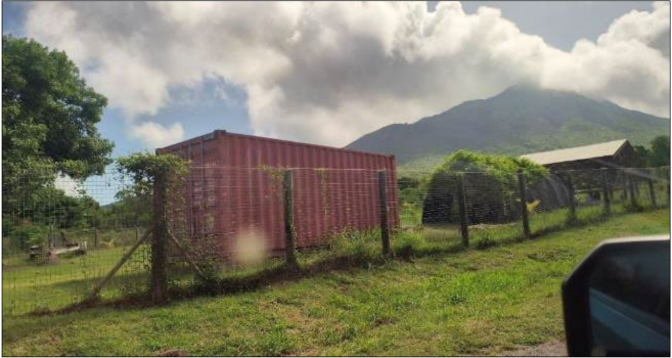
Photo 1: Coconut Farm near the Project site (the Project will not affect any structures within this farm).